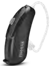
Velvet Black (P8)