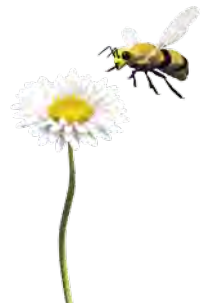
Phonak CROS II-13