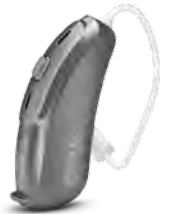
Graphite Gray (P7)