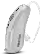
Silver Gray (P6)