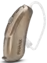
Sand Beige (P1)

Choose from 11 colors to either match your skin tone or hair color.