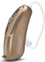
Amber Beige (P2)